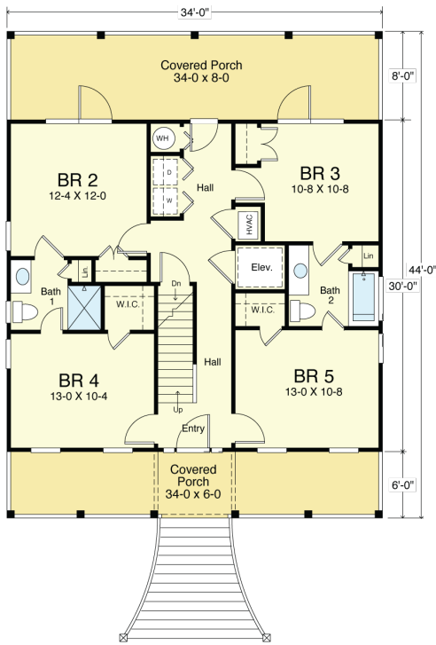
FIRST FLOOR PLAN 1,020.0 S.F. 8' Ceilings