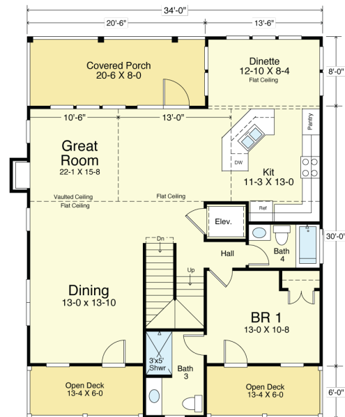
SECOND FLOOR PLAN 1,172.0 S.F. 9' Ceilings