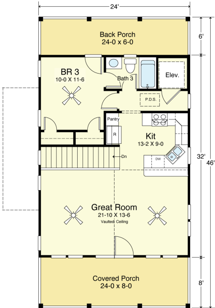
SECOND FLOOR PLAN 768.0 S.F.